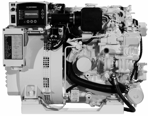
6.5/5.0 EDT Marine Diesel Generator (shown with optional white paint)

Operating at 1800 or 1500-rpm with a tuned air intake silencer and 3-cylinder engine, this D-NET™ generator runs smooth and quiet. Augmenting this desired effect is the electronic governing that virtually eliminates "droop" when load is applied. Include the optional Sound Guard SST with high quality stainless steel base and frame with stylish powder coated aluminum panels and you have a generator as attractive as it is quiet.